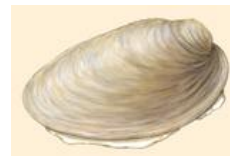
ADW Mollusca Pictures

Filter feeding animals Siphons- hollow tube used for sucking in and releasing water Oyster makes pearls- sand is covered by a thin sheet of nachre