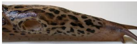
ADW Mollusca Pictures