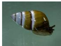
ADW Mollusca Pictures

5. Shell- an exoskeleton protecting the soft body