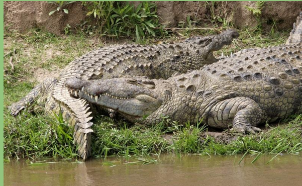
New Guinea Crocodile