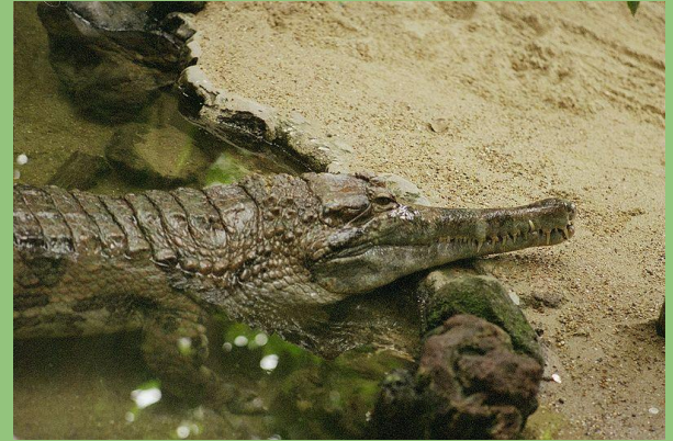
Slender Snouted Crocodile